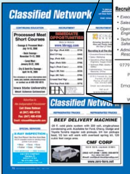
Sample 3" Ad (above) 6x rate=$315/mo.